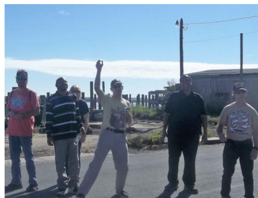
The NLES Walking Trail Assessment Team posing for a photo along the waterfront in Wachapreague!