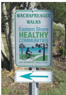
Enjoy your walk on the Wachapreague ESHC Walking Trail!

If you would like to add an observation or comment regarding this trail please e-mail e.fillebrown@gmail.com and include ESHC Wachapreague Walking Trail in the subject line.