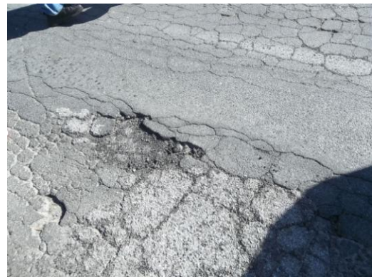
Users should use caution around potholes and broken asphalt along this walking trail.

is along residential, asphalt streets and remains mostly flat. Several pot holes and broken asphalt were noted at various points along this walking trail and therefore anyone waking this trail with a physical disability should use caution. Our Assessment Team would also like to note that the entire town of Wachapreague is at risk of flooding after a heavy rain due to its proximity to the water. Rain often leaves large portions of this trail completely under water.