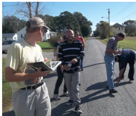
The NLES Walking Trail Assessment Team during their Wachapreague ESHC Trail assessment!

Our Assessment Team found that the majority of the terrain along this walking trail as “acceptable” for users who may have a disability. The entire trail